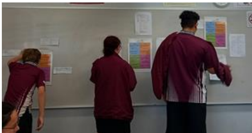
Students accessing the Bump it up Wall to improve their work.

Student data was tracked throughout the semester to identify opportunities for further support, intervention and extension. Data was continuously shared with students to help them reflect on their progress and plan their next learning steps. Students were encouraged to attend school every day, attend after school tutorials or Recharge and complete extra self-directed work on Mathspace.